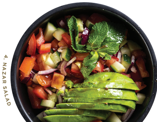
4. NAZAR SALAD