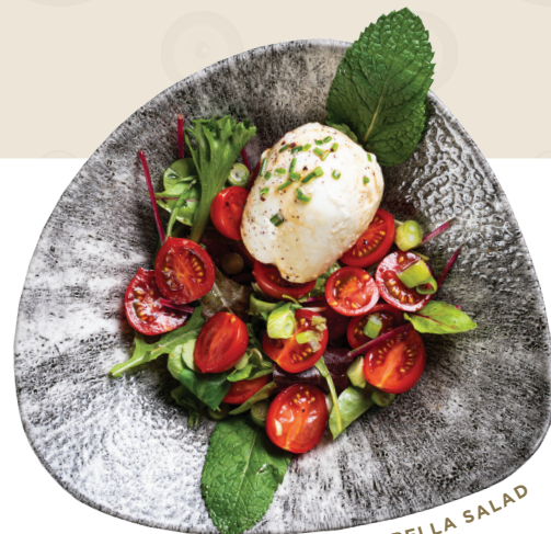
3. MOZZARELLA SALAD