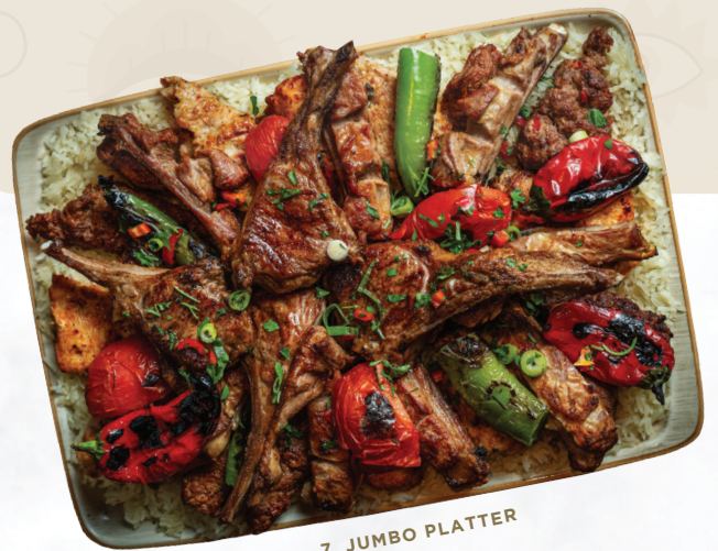
7. JUMBO PLATTER

Adana, lamb shish, chicken shish, lamb ribs, lamb chops (x4), chicken wings, chicken beyti, lamb beyti