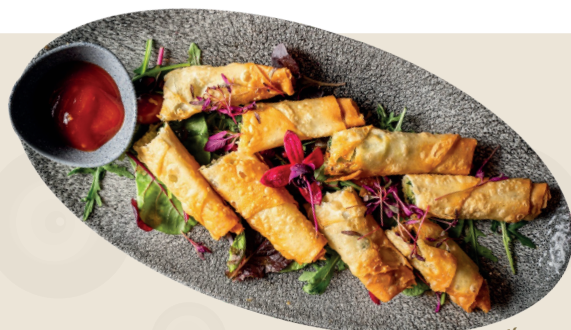
2. SIGARA BOREK