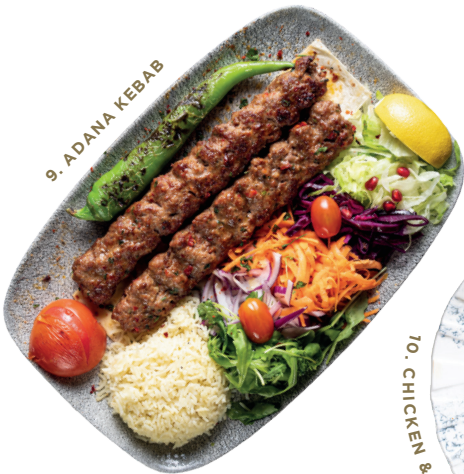
9. ADANA KEBAB