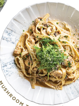
10. CHICKEN & MUSHROOM TAGLIATELLE