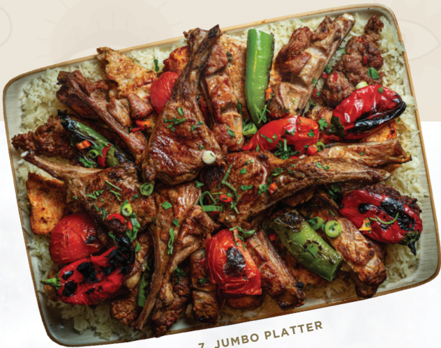
7. JUMBO PLATTER

Adana, lamb shish, chicken shish, lamb ribs, lamb chops (x4), chicken wings, chicken beyti, lamb beyti