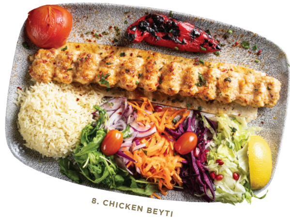
8. CHICKEN BEYTI